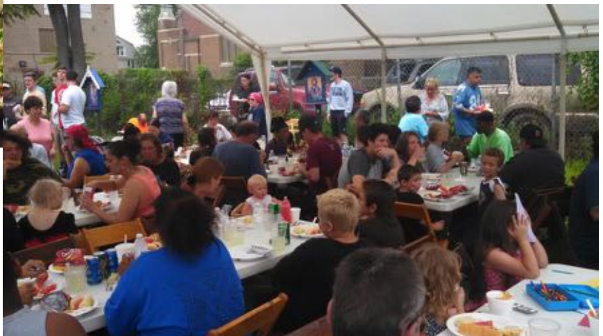
Above: Sunday Meal